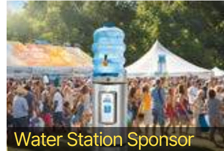
Water Station Sponsor